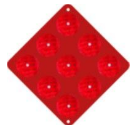
Figure 2. Prismatic end-of-road sign

It should be noted (1) that three of these neighborhoods are adjacent to and therefore in a sense part of the Village; (2) that all four either end in cul-de-sacs or have no significant through traffic; (3) that a fifth neighborhood also adjacent to the Village (Millrock Road, North Manheim Blvd., Harrington Street, Ulster Road) is unlighted; and (4) that, insofar as the Committee is aware, there have been no accidents or crimes associated with the lack of streetlighting in this neighborhood.